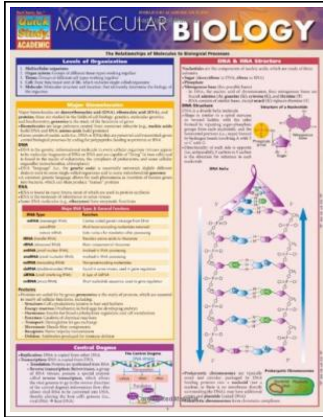
Filesize: 8.14 MB